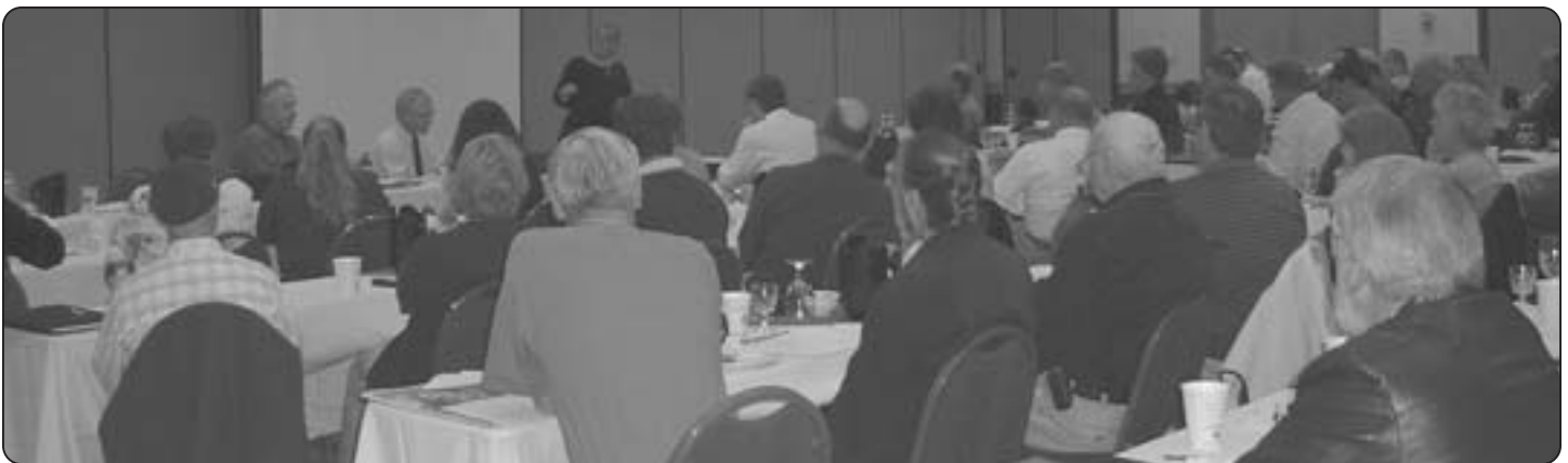
Sixty-six chapter members and guests benefitted from the excellent presentations by community leaders from across the state. The three-day event that offered twelve hours of continuing education was very well received by all in attendance. If you weren't there this year, plan to join us next year.